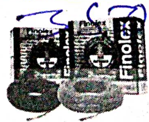
FLAME RETARDANT (FR) PVC INSULATED INDUSTRIAL CABLES