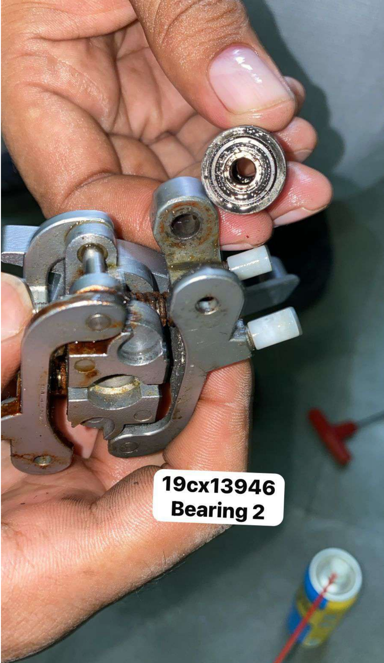
19cx13946 Bearing 2